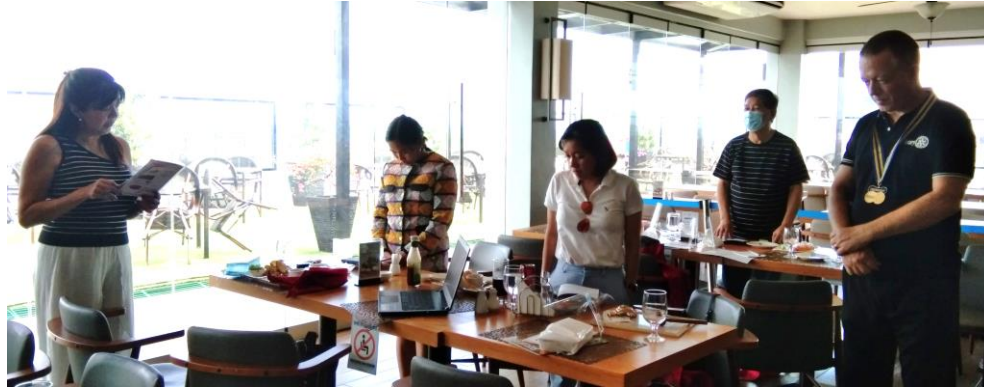
RC South Davao Regular Meeting... Sept. 2, 2020 @ Sky View, Blue Lotus Hotel